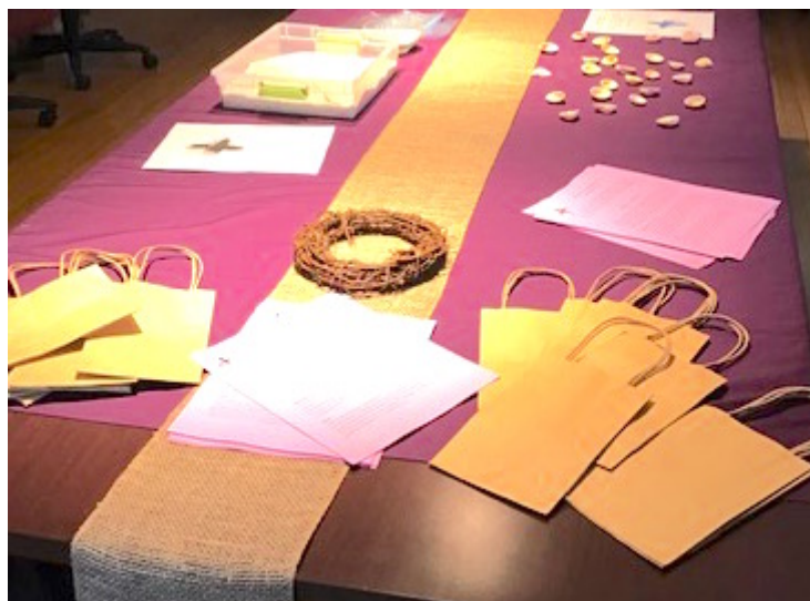
St. Johns Episcopal Church - Ellicott City, Maryland