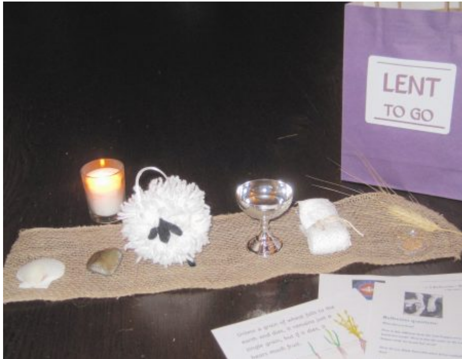
The Parish of the Epiphany - Winchester, Massachusetts