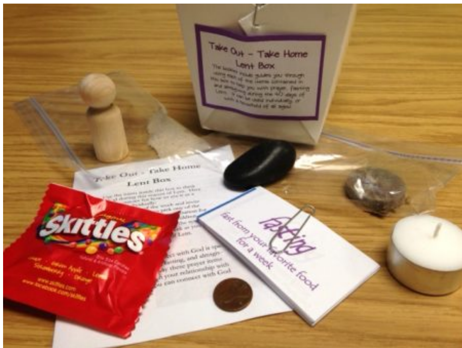
St. James Episcopal Church - Marietta, Georgia