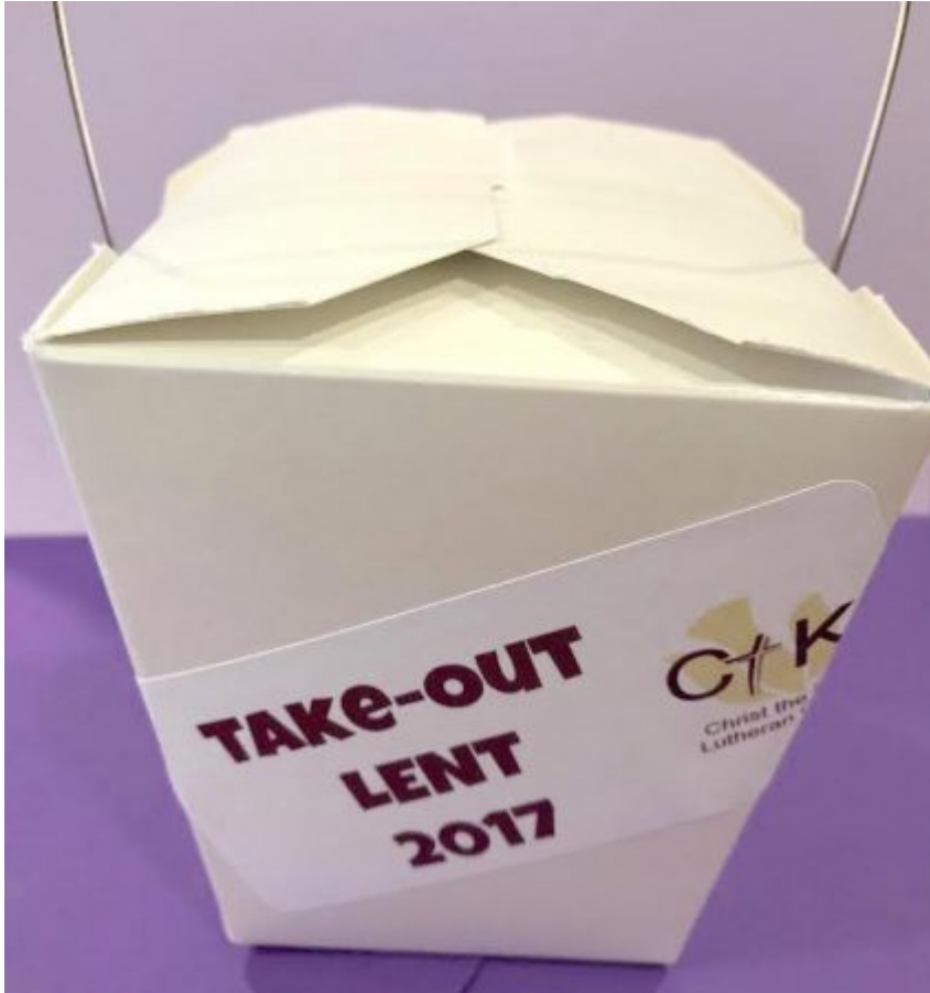
Christ the King Lutheran Church - Bozeman, Montana