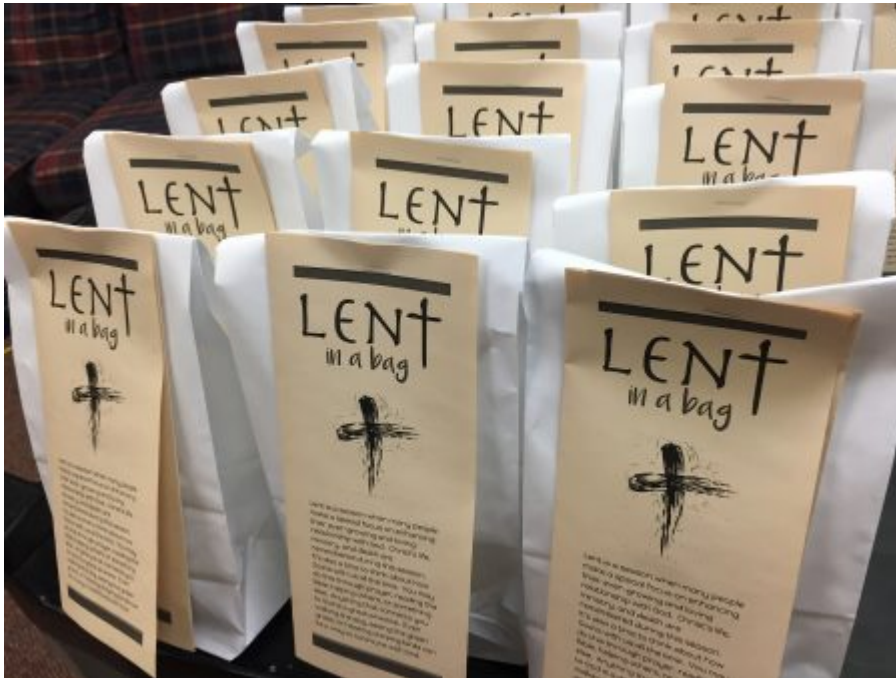
First United Methodist Church - Grove, Oklahoma