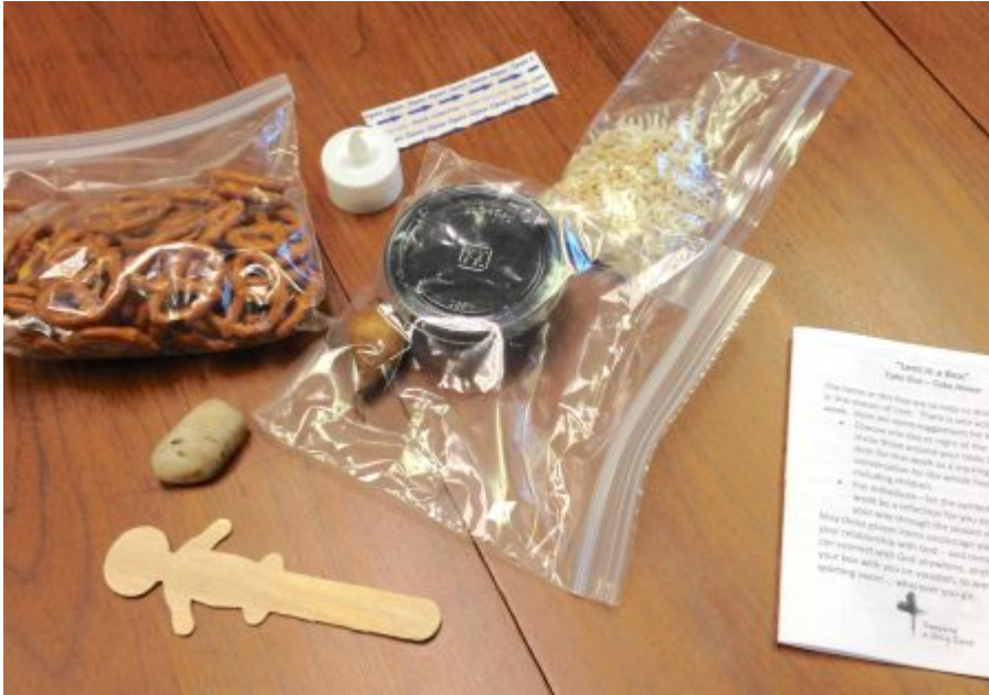
Presbyterian Church of Chestertown - Chestertown, Maryland