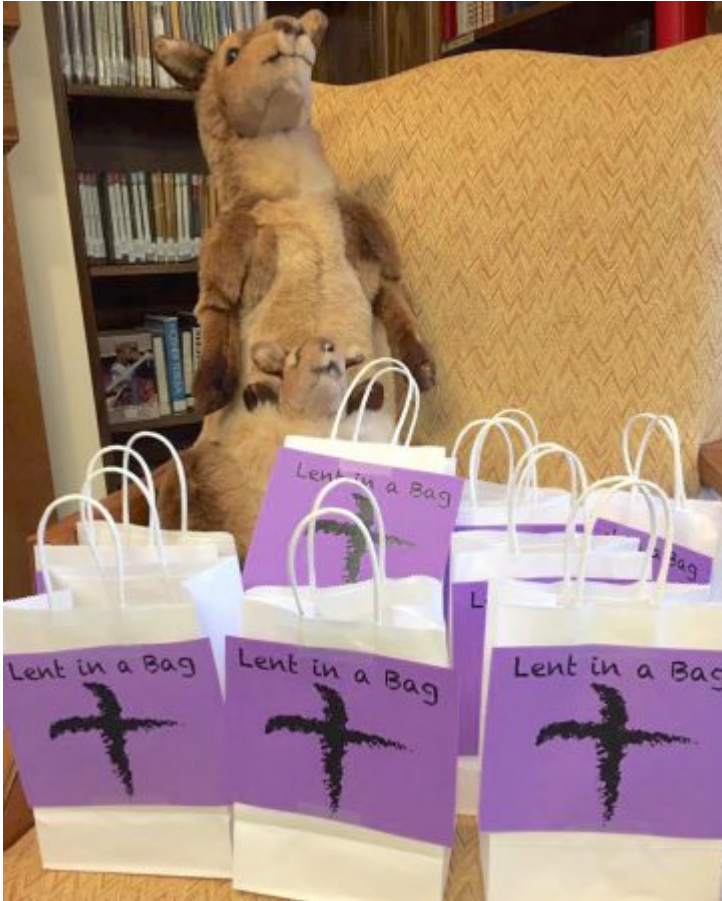
Church of the Ascension - Knoxville, Tennessee