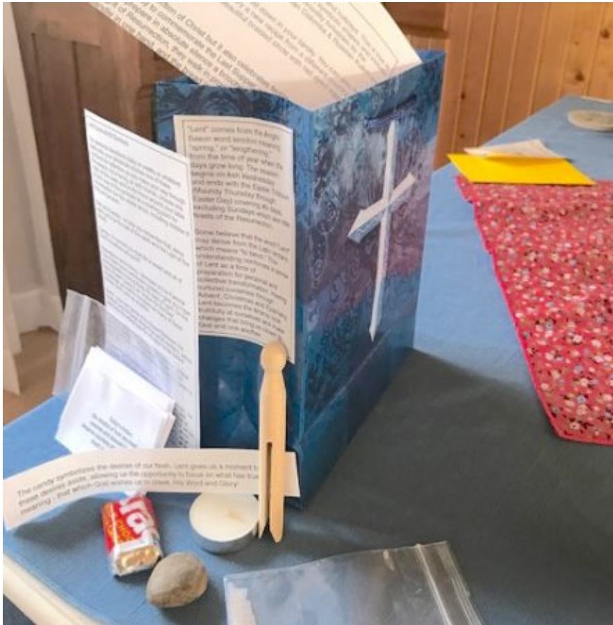
St. Matthias' Episcopal Church - Minocqua, Wisconsin