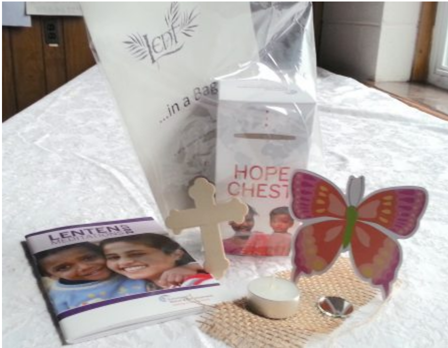
St. Gregory's Episcopal Church - Parsippany, New Jersey