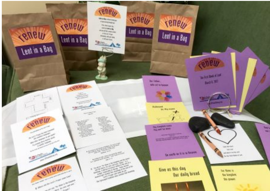
St. Paul's Episcopal Church - Delray Beach, Florida