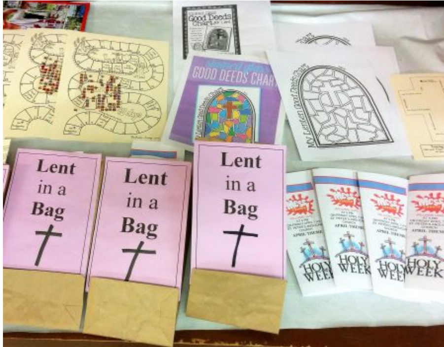
St. Peters Anglican Church - Williams Lake, British Columbia