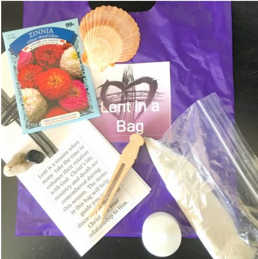
St. Margaret's Episcopal Church - Annapolis, Maryland