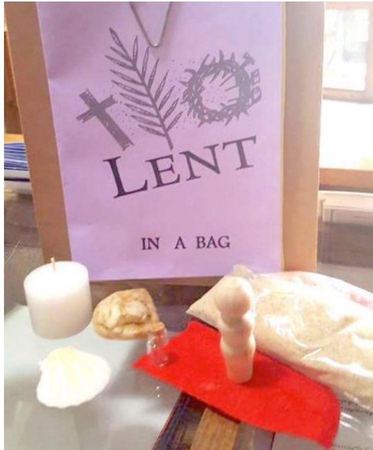
Good Shepherd United Methodist Church - Woodbridge, Virginia